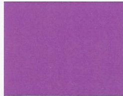
PANTONE Purple C