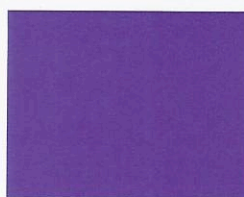
PANTONE Violet C