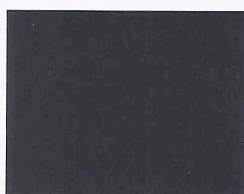
PANTONE Process Black C