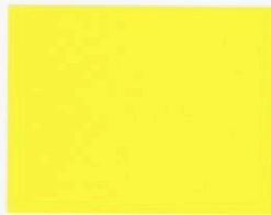
PANTONE Process Yellow C

Certified according to the European Standard EN13432