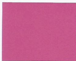
PANTONE Rubin Red C