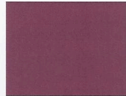
PANTONE 208 C