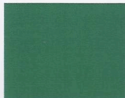
PANTONE 3425 C