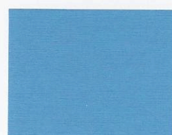
PANTONE Process Blue C